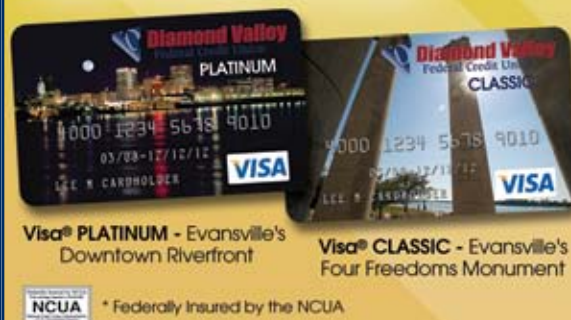
Visa® PLATINUM - Evansville's Downtown Riverfront

We've added a touch of Evansville to our New Visa Credit Cards!